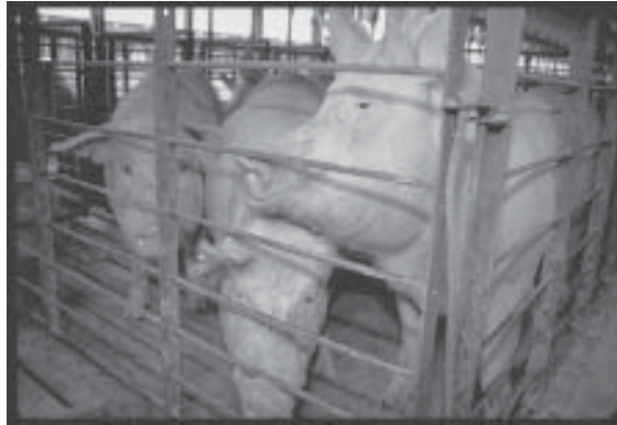
Swine in CAFO

Numerous CAFO wastes contribute to odor pollution (14), which, even at low concentrations, can cause gastrointestinal, stress-related, and respiratory symptoms, including by interacting with the brain and organ systems (15,16). Compared to people in areas of dairies or no livestock, neighbors of swine CAFOs were less often able to go outside or open windows in nice weather (10).